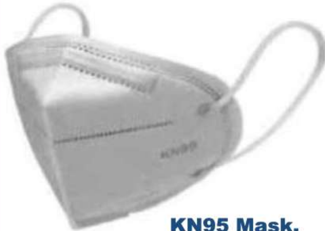
KN95 Mask, DDM-9500

To prevent transmission of the coronavirus from patient to the front-line medical workers, mask is the most necessary thing to use. Having a good quality surgical mask is not only preventing the transmission of the virus, but also can reduce the amount of viral particles released.