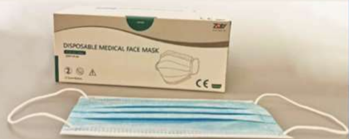
3-ply Face Mask